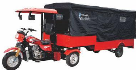
LEFT-SIDE FRONT VIEW