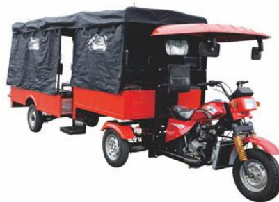
RIGHT-SIDE FRONT VIEW