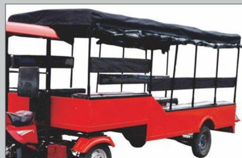
SPACIOUS PASSENGER DECK