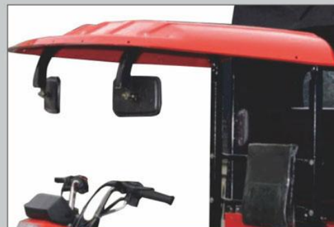
DRIVER TOP COVER