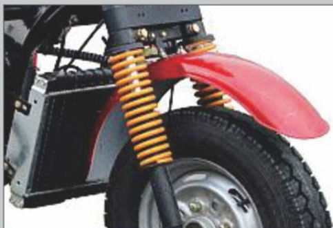
FR SHOCK ABSORBER